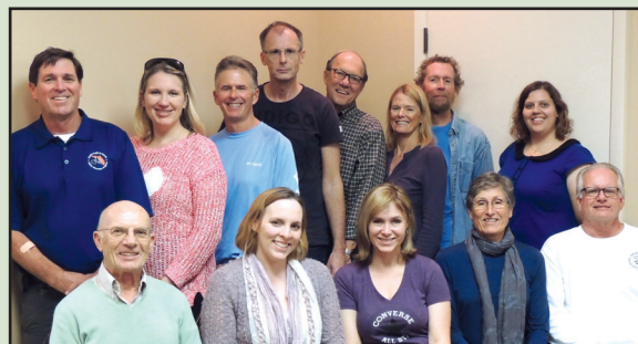
Members of BikeWalkLEE

1000 Friends of Florida is playing a vital role in BikeWalkLee's advocacy work by furthering the complete streets/livable communities movement throughout Florida through its many webinars, as well as its complete streets resources webpage.