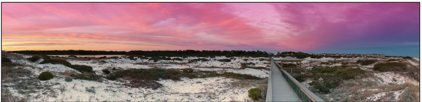
Deer Lake State Park

1000 Friends of Florida and allies continue to fight to ensure that Amendment 1 provides significant funding for land conservation to protect the best of our state for future generations.