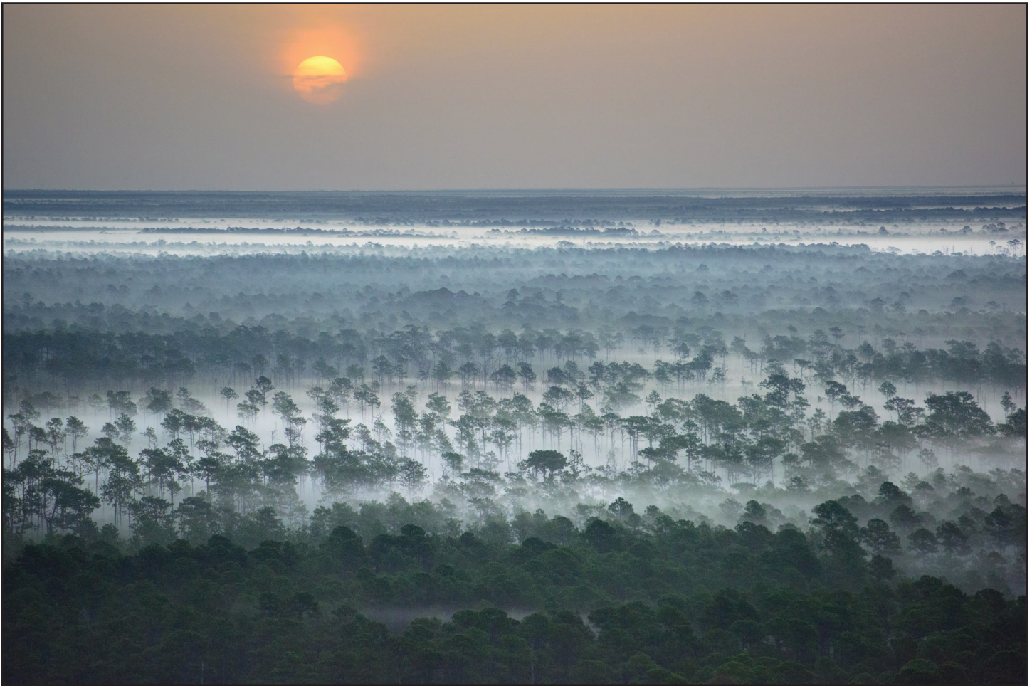
Eglin Air Force Base, Part of World's Largest Connected Corridor of Longleaf Pine Trees