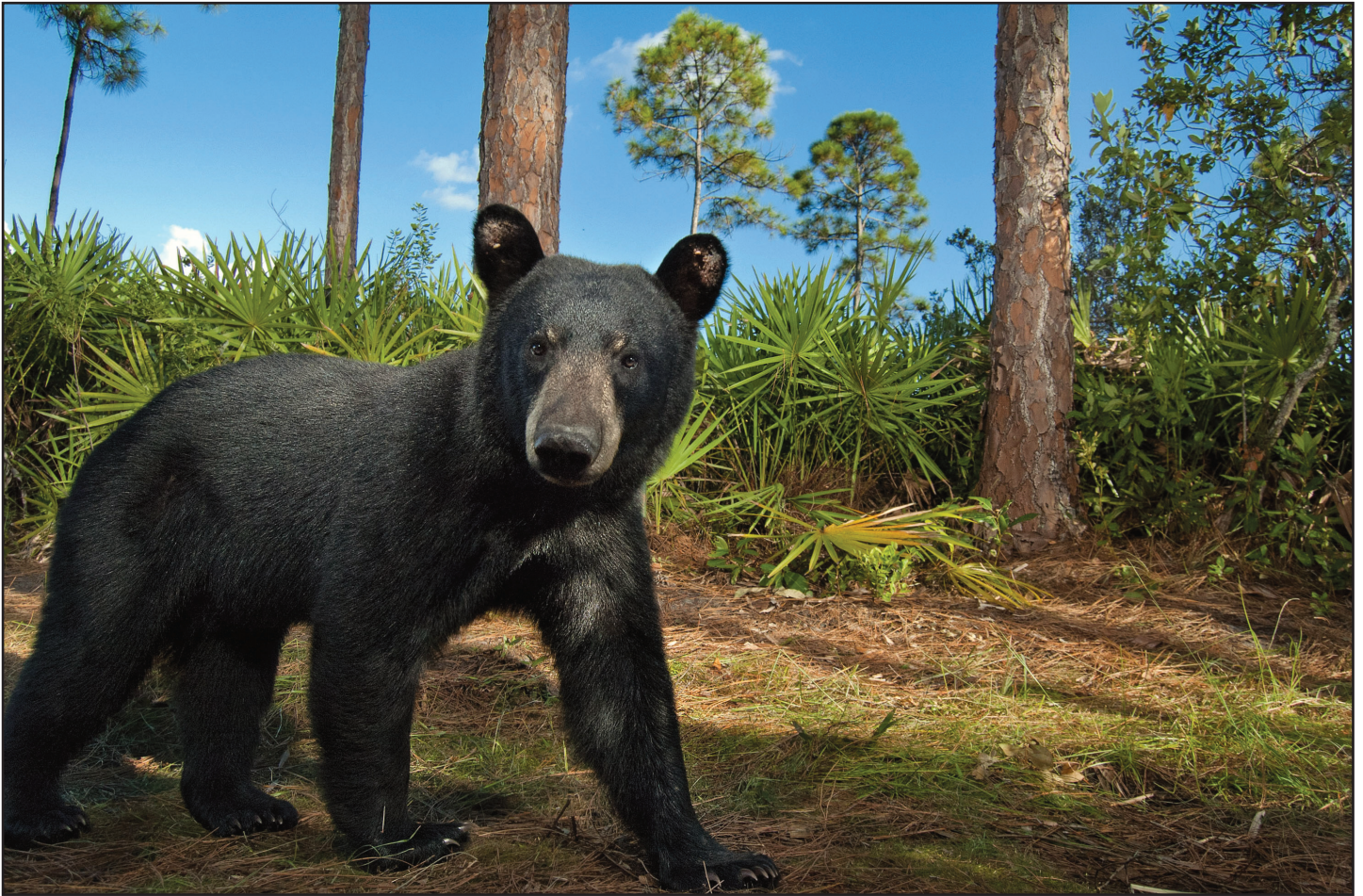
One of Highland County's endangered black bears

Photo by Carlton Ward Visit CarltonWard.com and @CarltonWard on Instagram and Twitter