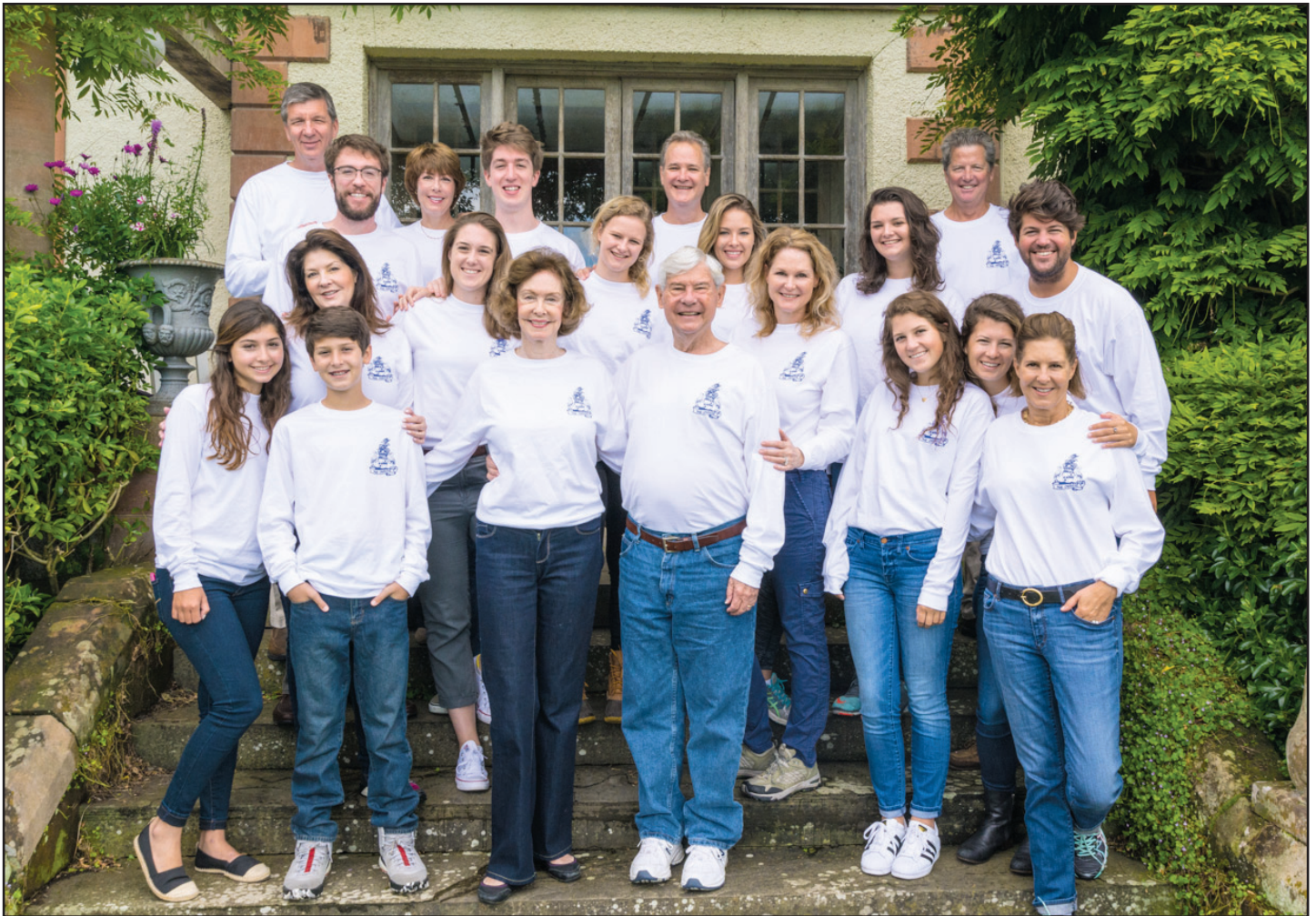
Adele and Senator Bob Graham and Family

From the late 1960's until this decade, Floridians rejected the previous definition that our state was a commodity of no intrinsic value. Instead, they recognized Florida as a unique treasure which each generation has an obligation to protect for themselves and the future.