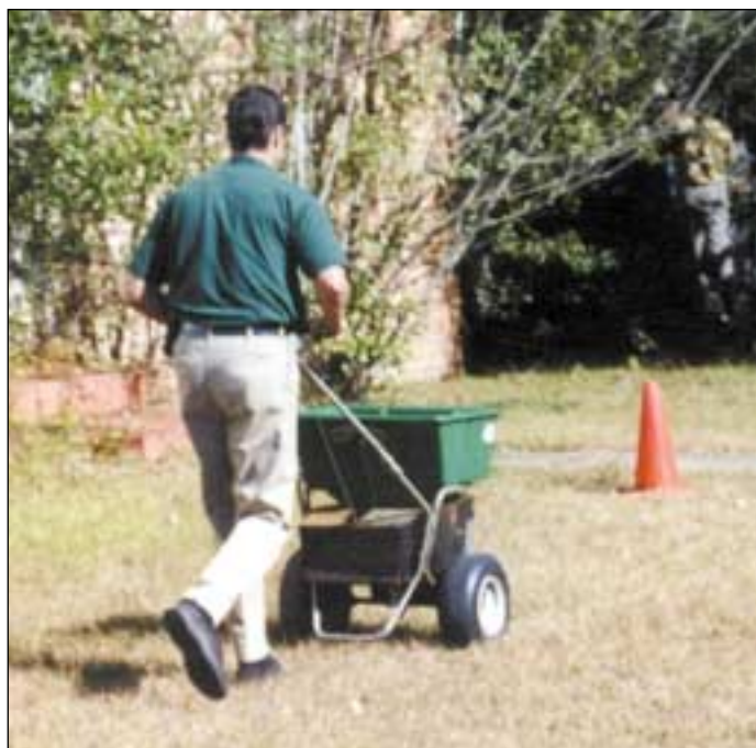
Figure 25. Calibrate spreaders frequently.

Calibrate using clean water and do not calibrate equipment near wells, sinkholes, or surface waterbodies. Measure pesticides and diluents accurately to avoid improper dosing, the preparation of excess or insufficient mixture, or the preparation of a tankload of mixture at the wrong strength.