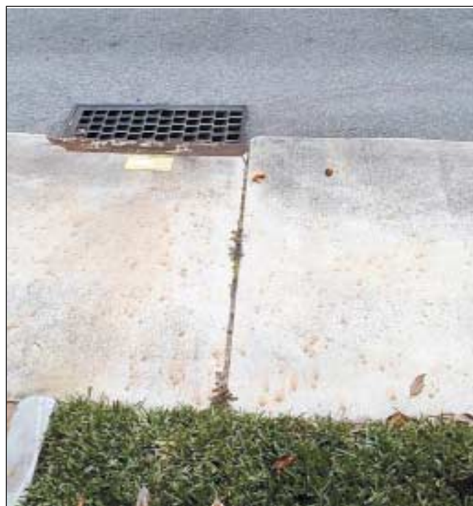
Figure 3. Poor fertilization technique wastes fertilizer, causes unsightly stains, and pollutes our waterbodies. Note the trail of stains on this sidewalk.

Inadequate nutrition results in thin, weak plants that may be more susceptible to insects, weeds, and diseases. Certain diseases, such as rust and dollar spot, can occur in turf maintained under low-nutrient conditions. Overfertilization can also enhance plant susceptibility to pests and diseases. Several pesticide applications may be required to alleviate problems that would not have been as prevalent under a proper nutrition program. Proper fertilization can alleviate these conditions.