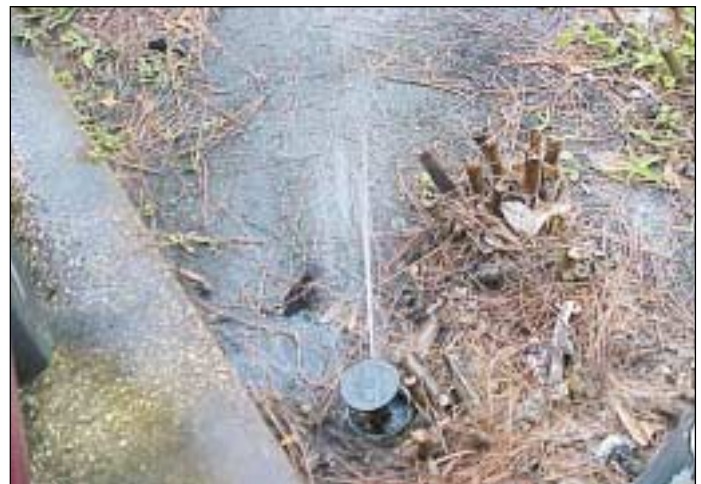
Figure 12. Object is interfering with spray pattern, resulting in poor distribution uniformity.

Figures 9–15 depict some examples of improper irrigation system design or installation.