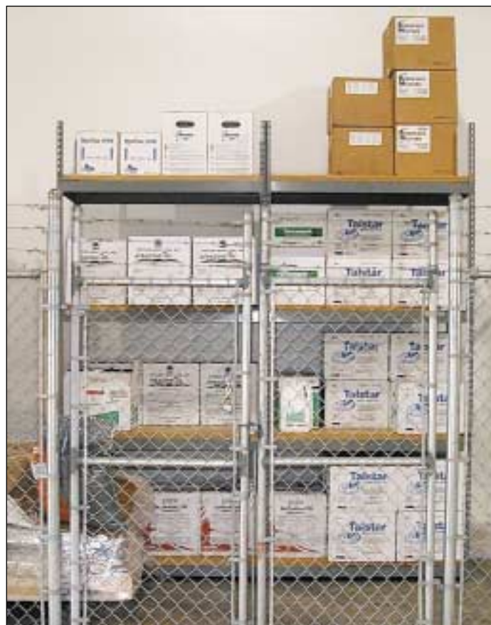
Figure 24. Pesticide storage areas should be locked.

Store pesticides in their original containers. Do not put pesticides in containers that might cause children and others to mistake them for food or drink. Keep the containers securely closed and inspect them regu-