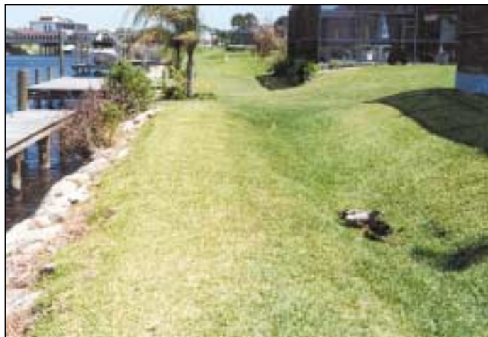
Figure 20. Leave a “Ring of Responsibility” as shown by the lighter green area, to prevent pollution.

Except when adjacent to a protective seawall, always leave a “Ring of Responsibility” around or along the shoreways of canals, lakes, or waterways. This avoids fertilizing too close to a body of water. It is important to ensure that fertilizers and other lawn chemicals do not come into direct contact with the water or with any structure bordering the water, such as a sidewalk, brick border, driveway, or street.