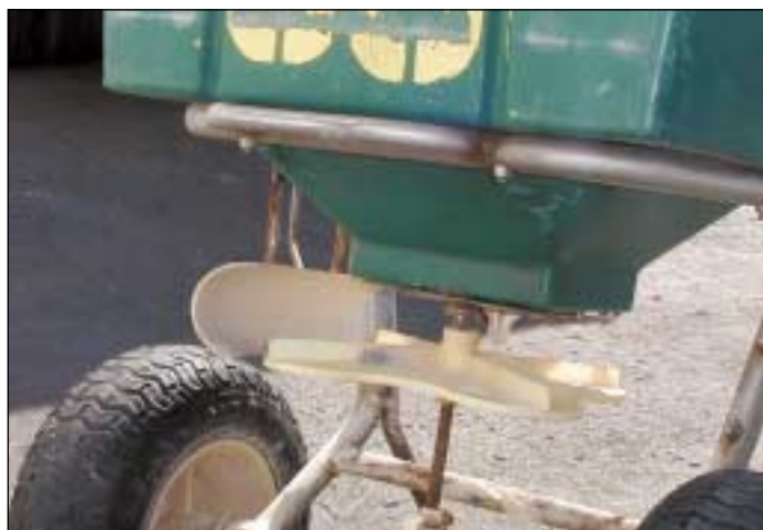
Figure 21. Spreader with deflector shield installed.

If you are applying fertilizer without a deflector shield, the Ring of Responsibility should extend at least 10 feet from the edge of the water.