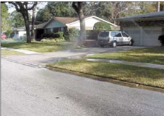
Figure 11. Overirrigation runoff. Small turf area should be irrigated with spray heads, not sprinklers.

Common irrigation efficiency problems include leaks, sprinkler head plugging, poor irrigation uniformity caused by nozzle wear, and poor system pressure. Fixing some problems (such as repairing leaks and replacing nozzles) can be accomplished at a minimal cost, while others (such as poor system design) might, at first glance, be very costly. In either case, problems need to be corrected as soon as possible to prevent the leaching of fertilizers/ chemicals and wasted water. In the long term, the investment made to improve the irrigation system pays off in reduced fertilizer/chemical and water bills.