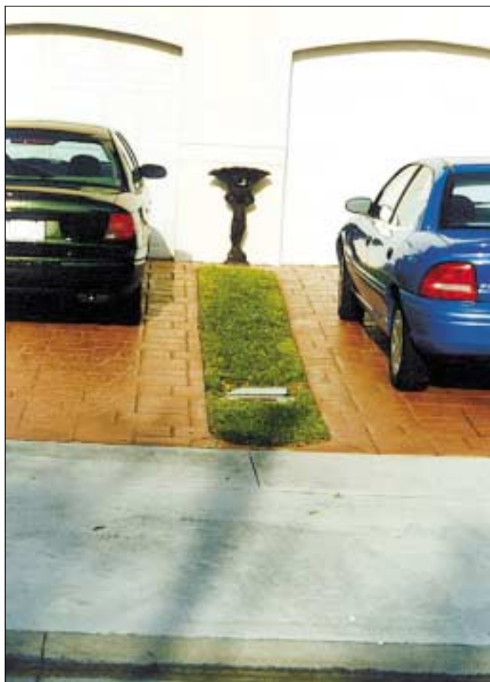
Figure 6. Narrow strips are difficult to maintain.

The long-term value of a landscape depends on how well it performs for its particular objectives. Performance is often directly related to matching a site's characteristics and a client's desires with plant requirements. Therefore, the first step in selecting appropriate plants for a landscape is to conduct a site evaluation, which may consist of studying planting site characteristics such as the amount of sun or shade, salt spray, exposure, water drainage, soil type, and pH. These characteristics will most likely differ between areas on the same property. For example, the area on one side of a structure may have significantly different light conditions than an area on the other side. The second step is to select plants with attributes that match the characteristics of the planting site.