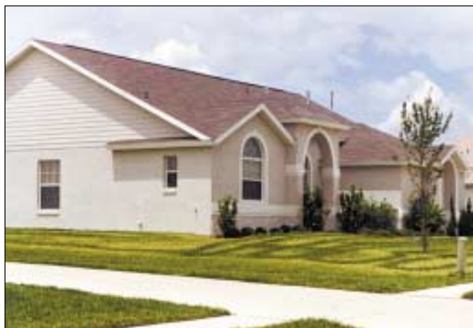
Figure 19. Streaking on a lawn caused by poor application techniques.

One of the most common nitrogen fertilizers is urea (46 percent N), which is a water-soluble, synthetic organic nitrogen fertilizer with quick N-release characteristics. Urea can be applied as either liquid or granules, and is subject to volatilization, or loss of nitrogen to the air. If urea is applied to the turfgrass surface and not incorporated through proper watering, significant quantities of N can be lost through volatilization.