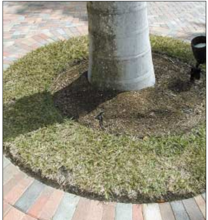
Figure 14. Mulch, not grass, should be used here.

For more information, see IFAS Publication ENH 103, Mulches for the Landscape , at http://edis.ifas.ufl.edu/MG251 .