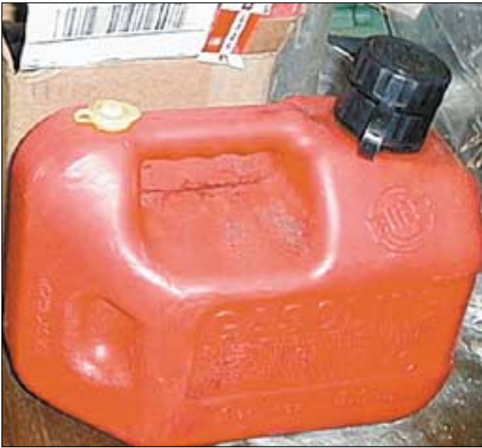
Figure 4. Plastic cans are not OSHA approved.