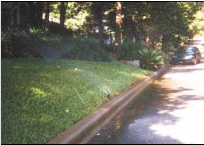
Figure 9. Poor Design – Turf and landscape plants should be separate zones and should not water the street.

FIS) for irrigation system evaluation, all of which can be traced to a process published by Miriam and Keller. By following any of these methods, you can ensure that a system is operating at optimum application/distribution efficiency.