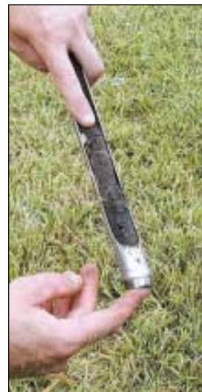
Figure 23. Soil Core

The IFAS Everglades Extension Soils Laboratory currently uses acetic acid to extract nutrients from all organic soils. Therefore, the extractants are calibrated to different soil types. These extraction procedures must be ascertained when approaching any laboratory for a soil analysis. The routine analysis includes a lime requirement determination if the soil pH is below 6.0. N is not determined, because in most soils it is highly mobile and its soil status varies greatly with rainfall and irrigation events.