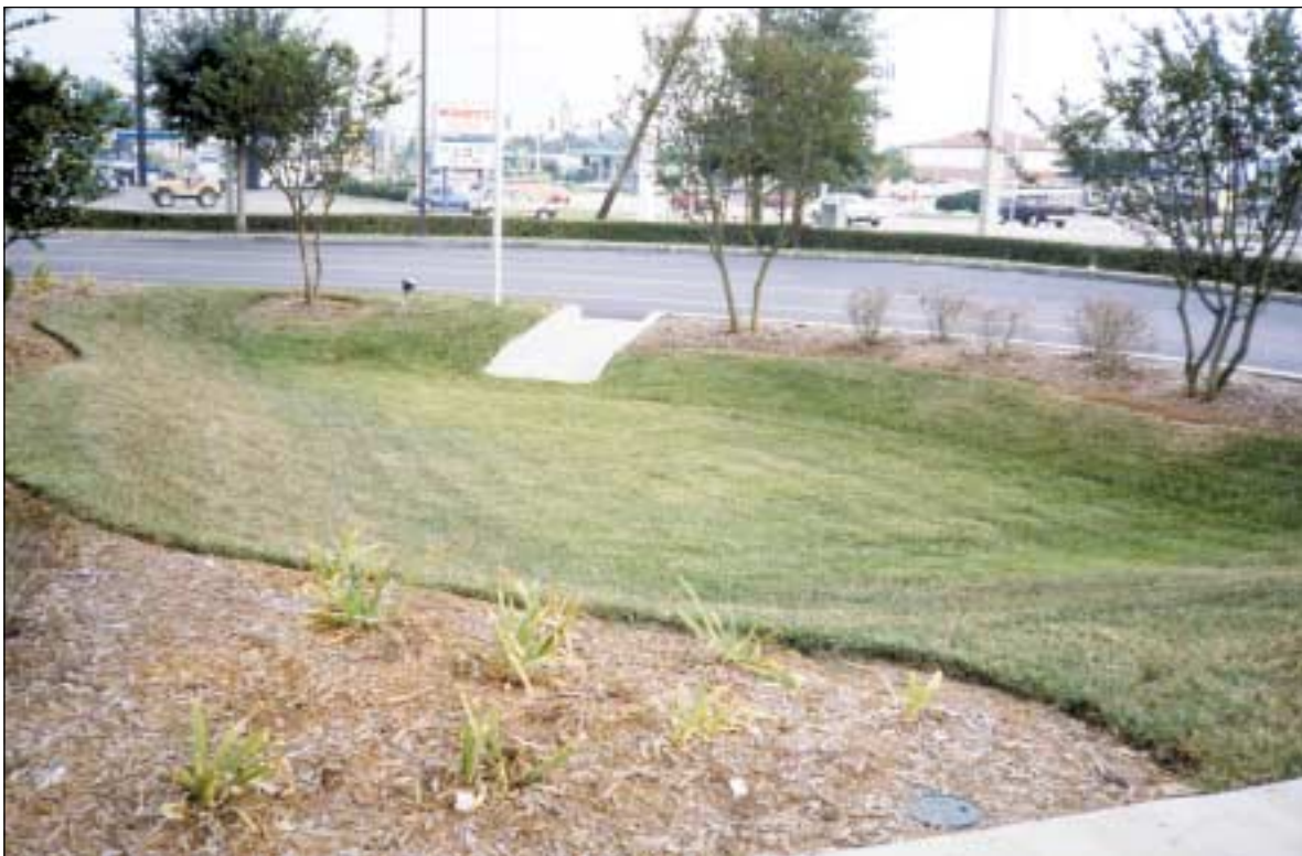
Figure 2. Grassy stormwater retention areas can add dimension to a lawn and protect our environment.

A healthy and vigorous turf with good plant density provides many benefits. Healthy grass is viewed as an aesthetic asset, and a growing body of evidence points to the positive health and environmental contributions made by lawns and other turf areas. Turfgrass plays a