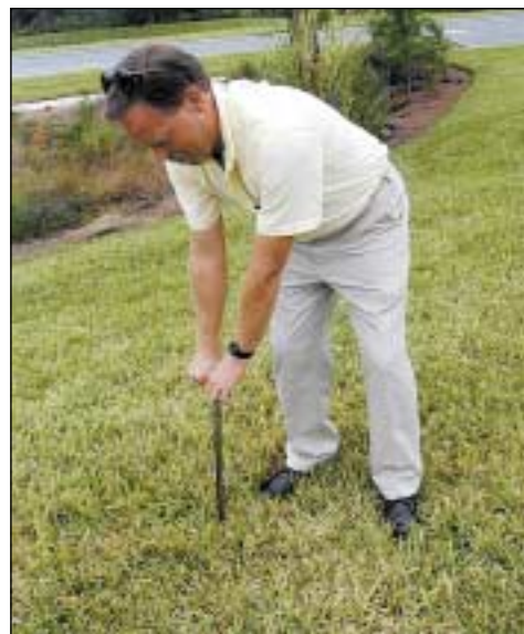
Figure 22. Taking a soil sample.

Although it may not be an essential practice for the everyday maintenance of a healthy landscape, testing to determine the soil's chemical properties before installing turfgrass or landscape plants is a recommended practice. Through soil testing, the initial soil pH and P level can be determined. Soil pH is important in determining which turfgrass is most adapted to initial soil conditions (bahia grass and centipedegrass are not well adapted to soil with a pH greater than 7.0). Since it is not easy to reduce the pH of soil on a long-term basis, you should use St. Augustine grass or bermudagrass on high-pH soils.