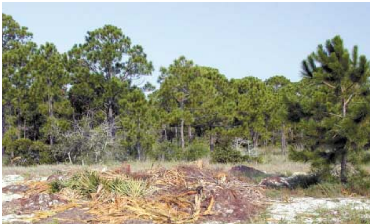
Figure 16. Illegal dumping of plant material.