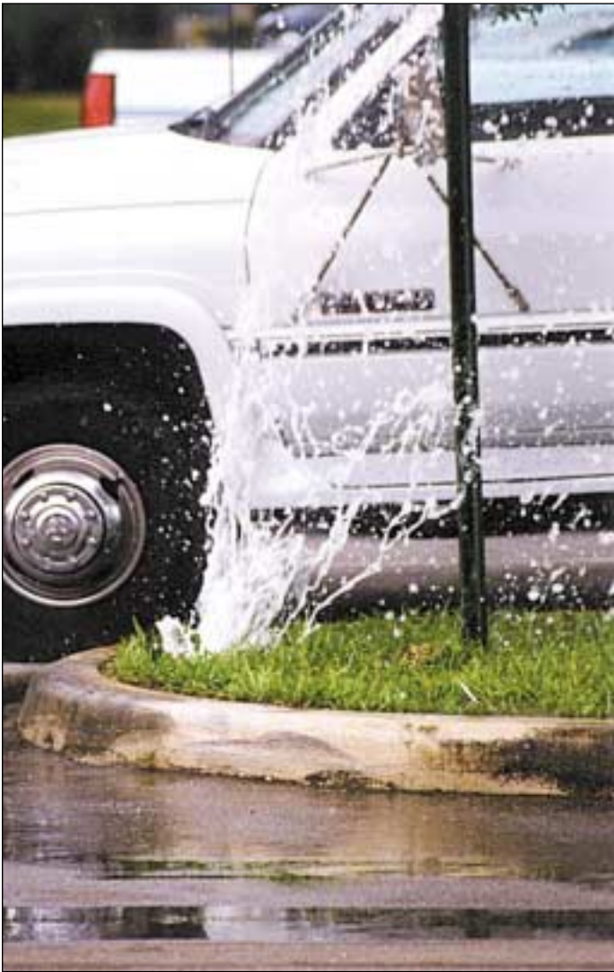
Figure 13. Water gushing from broken head.