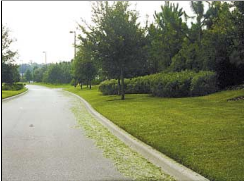
Figure 15. This is BAD! Never direct clippings into the street where they can enter the storm drain system.