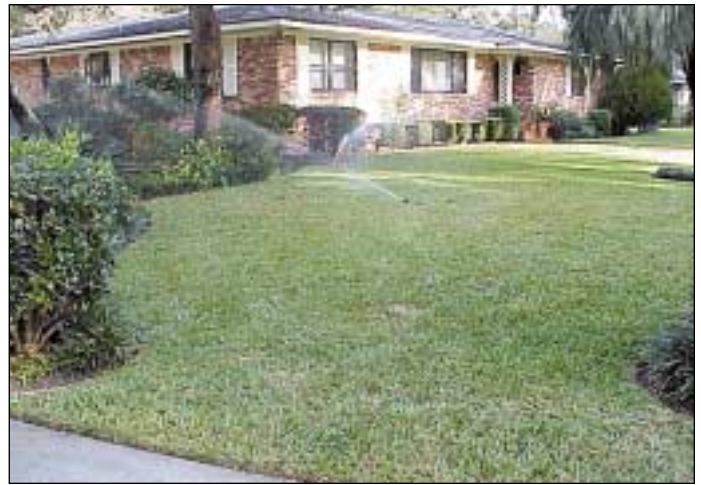
Figure 10. Poor design; system does not match irrigation requirements. The area needs to be rezoned with landscape and turf separated.