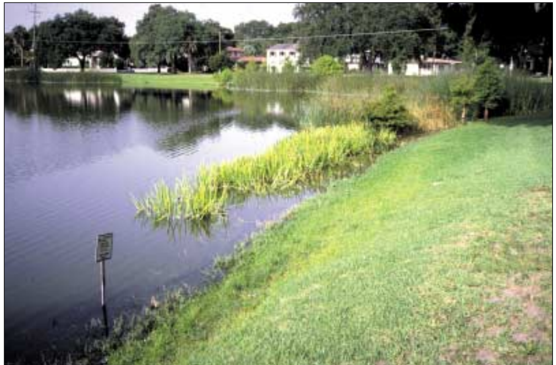
Figure 1. With proper BMP's, our water resources can successfully co-exist with residential landscapes.

Since the passage of the Clean Water Act and the formation of the U.S. Environmental Protection