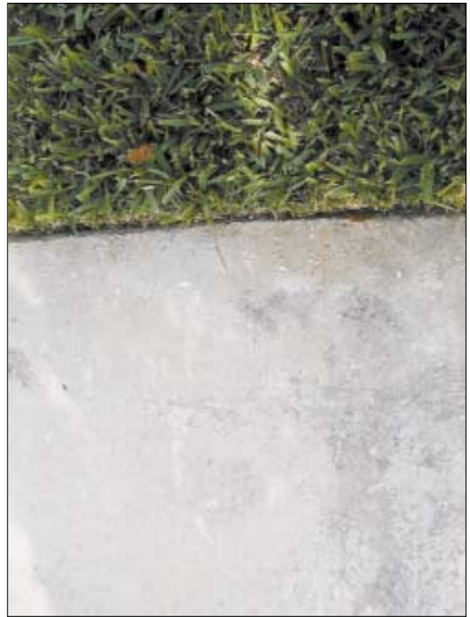
Figure 17. Fertilizers off target grow algae in lakes, not grass on lawns