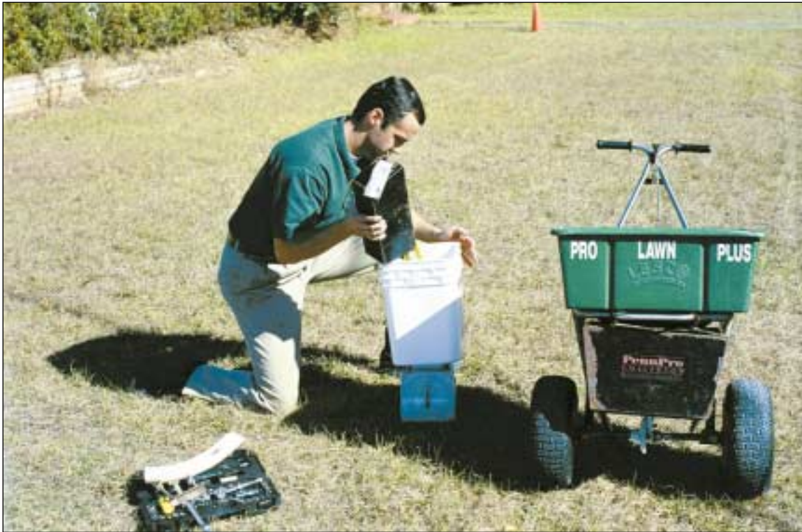
Figure 18. Weigh fertilizer to get accurate results.