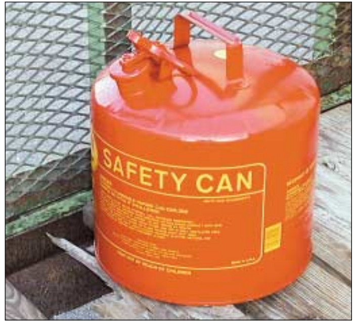
Figure 5. This can is approved but not properly secured.

administered by their own professional training staff. Smaller firms may choose to avail themselves of training available through professional associations or the county's IFAS Cooperative Extension Service.