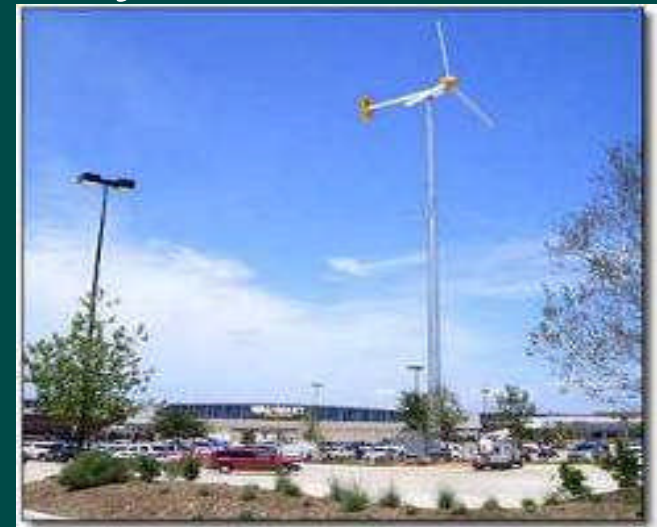
Wal-Mart with Wind Mill Generation