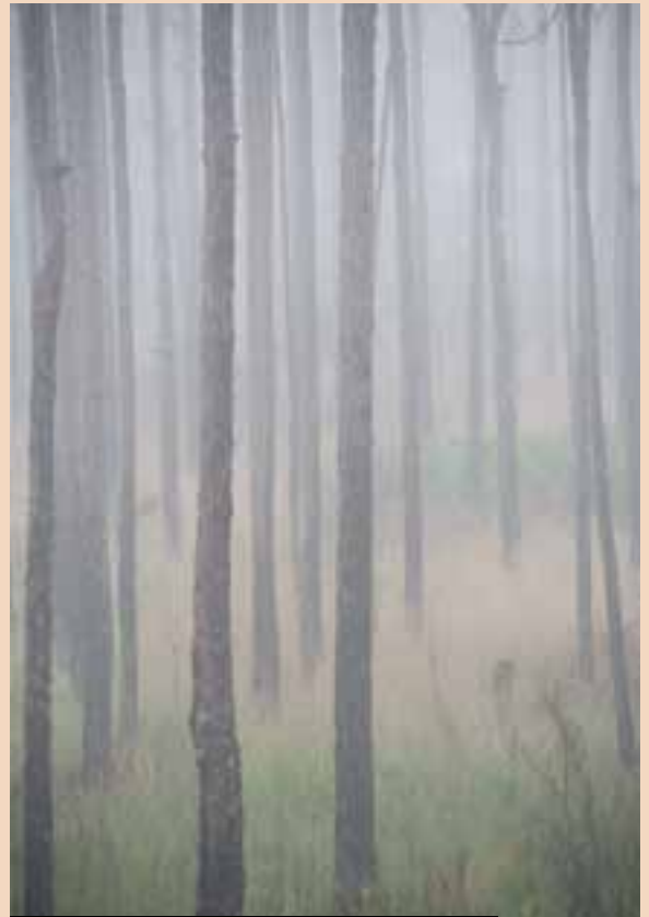
Pre-dawn fog hangs among the pines in central Florida.