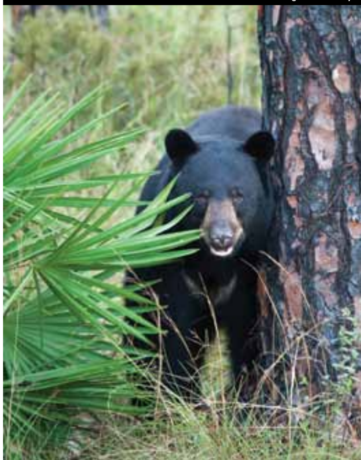
A mature male black bear finds excellent habitat on the Smoak Ranch in Highlands County.

....Instead of having a species' range reduced to isolated habitat islands, conservation lands would once again be part of connected ecological systems, especially after restoration plans were implemented on lands degraded by past human activities such as fire suppression and degraded ground and surface water hydrology.