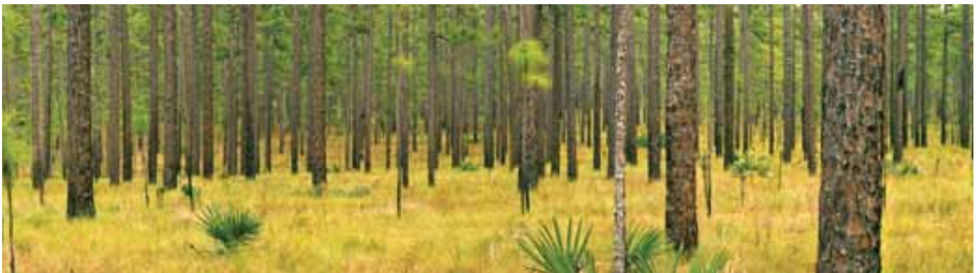
Long-leaf pines and wire grass run beyond the horizon in Ocala National Forest, an essential landscape in the Ocala to Osceola Corridor, the northern segment of the Florida Wildlife Corridor.