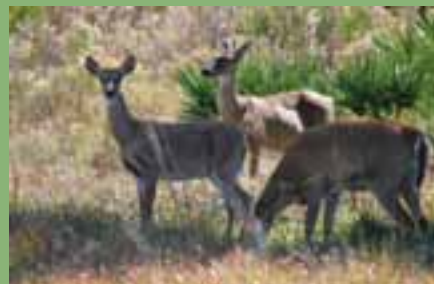
Three deer at Kissimmee Prairie Preserve State Park