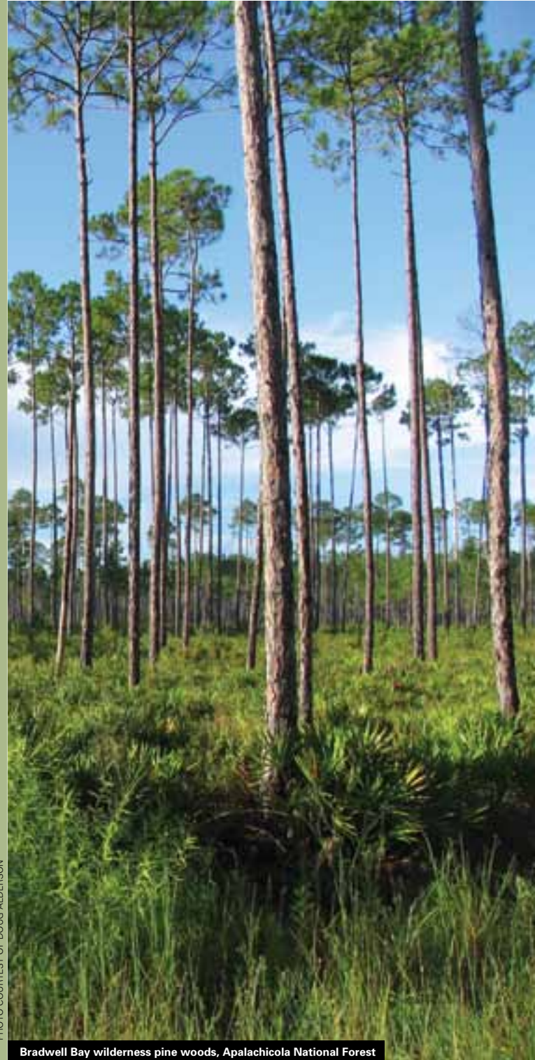
Bradwell Bay wilderness pine woods, Apalachicola National Forest