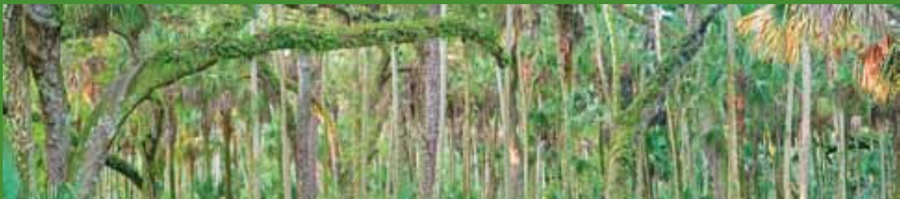
Highlands Hammock State Park, near Sebring, protects mature forests, providing habitat for diverse wildlife and ecological connectivity along the Lake Wales Ridge. Trails for biking, hiking and horseback riding, elevated boardwalks and camping sites make Highlands Hammock an important place for community recreation.

We thank the Plum Creek Foundation for its support for our work. We also thank Plum Creek for their significant contributions to protecting natural lands across the state and nation.