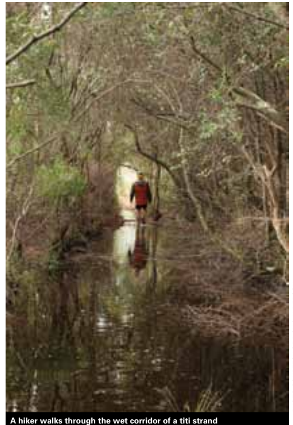
A hiker walks through the wet corridor of a titi strand