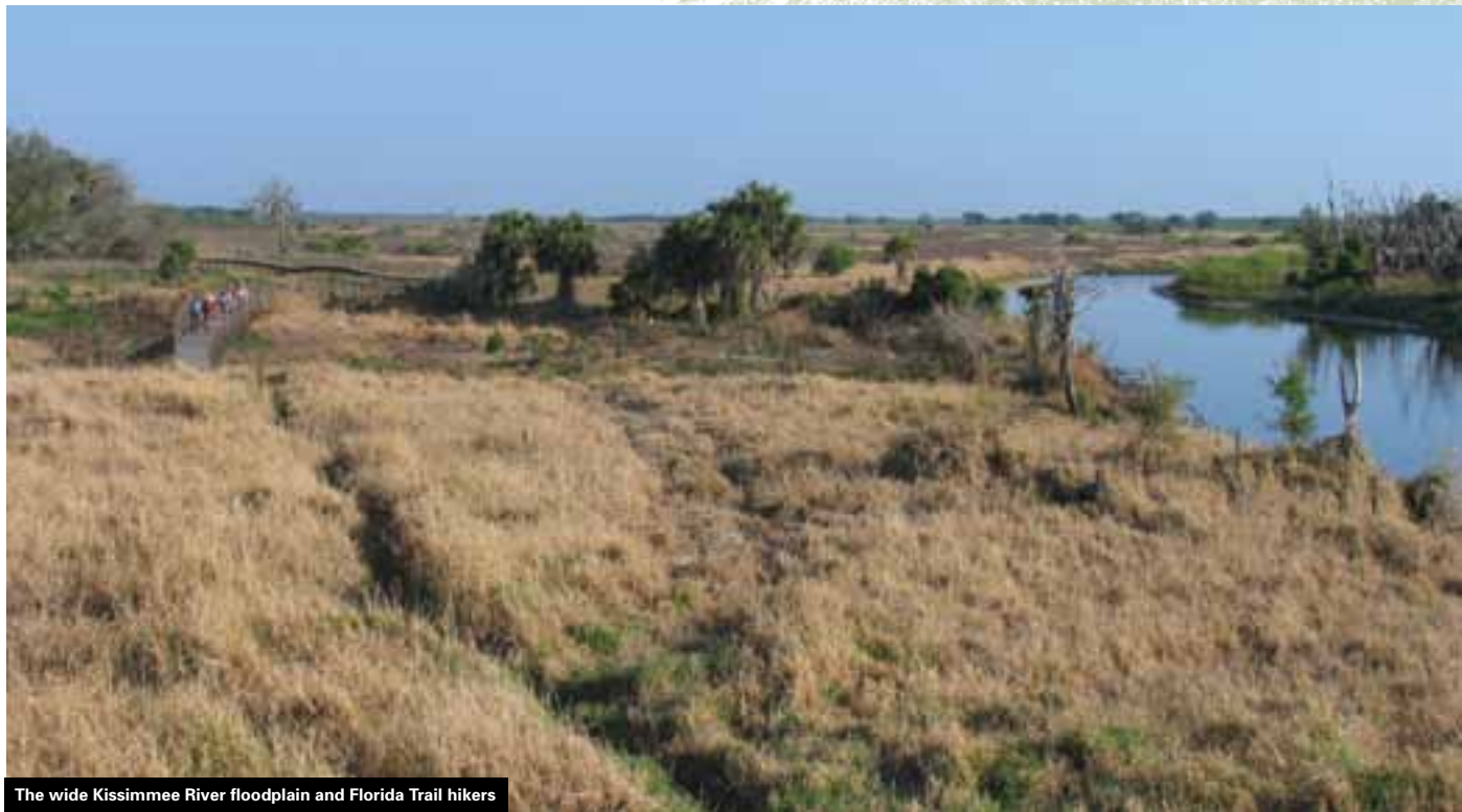
The wide Kissimmee River floodplain and Florida Trail hikers